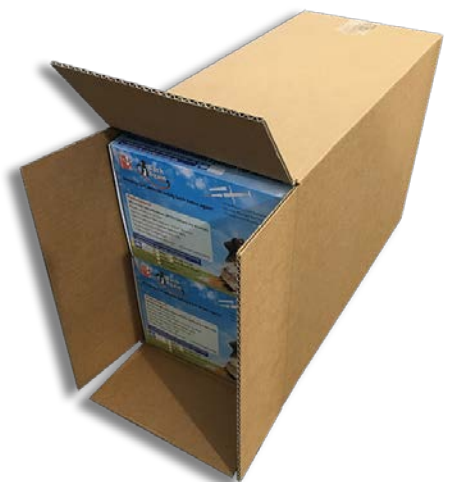
10 Carton Pack