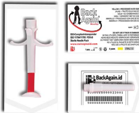
Re-usable Syringe Needle Pack